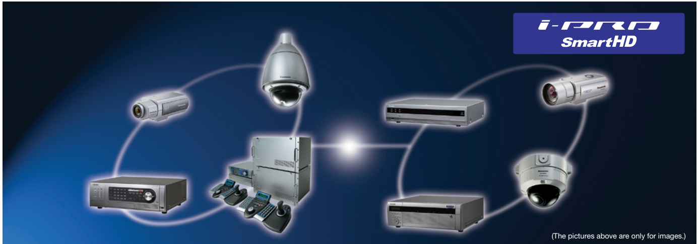
(The pictures above are only for images.)